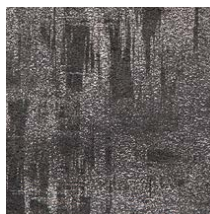
01 GUNMETAL (PRINTED ON 8002/09)