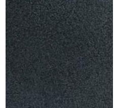
19 DEEP WATER