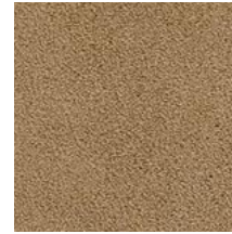
02 NATURAL WOMAN