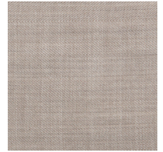
04 VALLEY FOG