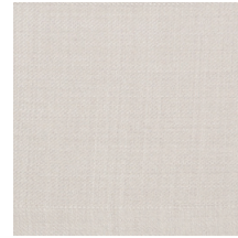
02 GOLDEN GREY