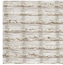
02 SILVER MARLIN