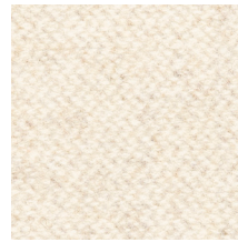
01 VANILLA BEAN

Knit backing is recommended for use on HOLLY HUNT upholstered product. For all other upholstery, please consult your workroom.