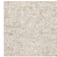
02 WARM SILVER