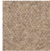
04 PEAT HEATHER