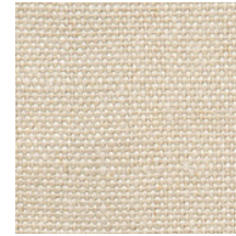
02 HALF BLEACHED