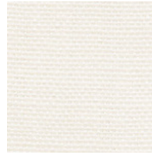
01 SOFT LIGHT

Knit backing is recommended for use on Holly Hunt upholstery product. For all other upholstery, please consult your workroom.