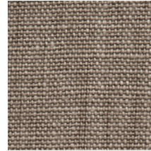
04 PEAT HEATHER