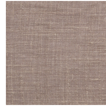
02 VALLEY FOG