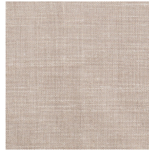
01 PEAT HEATHER