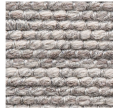
06 SILVER FOG