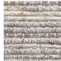
05 WARM & COOL