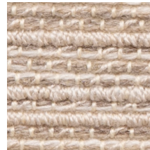
04 SAND PEARL