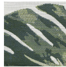
02 BALI BREEZE