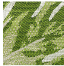
01 GREEN LEAF

Extensive cleaning instructions available at www.hollyhunt.com .