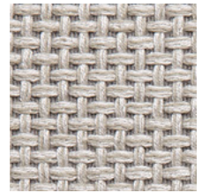
03 STEEL DUST