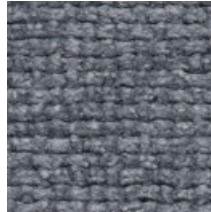
04 SILVER BLUE