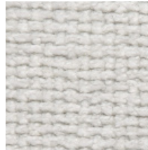
01 BRIGHT SILVER