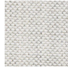
02 SILVER FOX