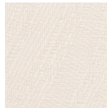
02 DEW DROPS