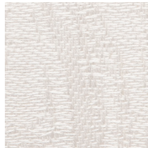
04 BRIGHT SILVER