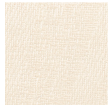
03 WINTER WHITE