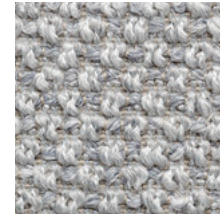
04 TRUE GREY