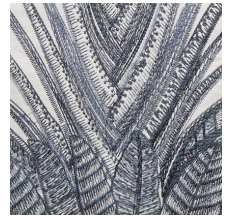
03 NEW BLUE