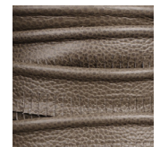
25 TRUE RAY