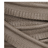
23 SEA OTTER