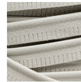
35 SOUTH CAPE