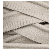
26 SEA PEARL