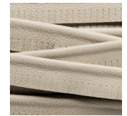
37 SEA GULL