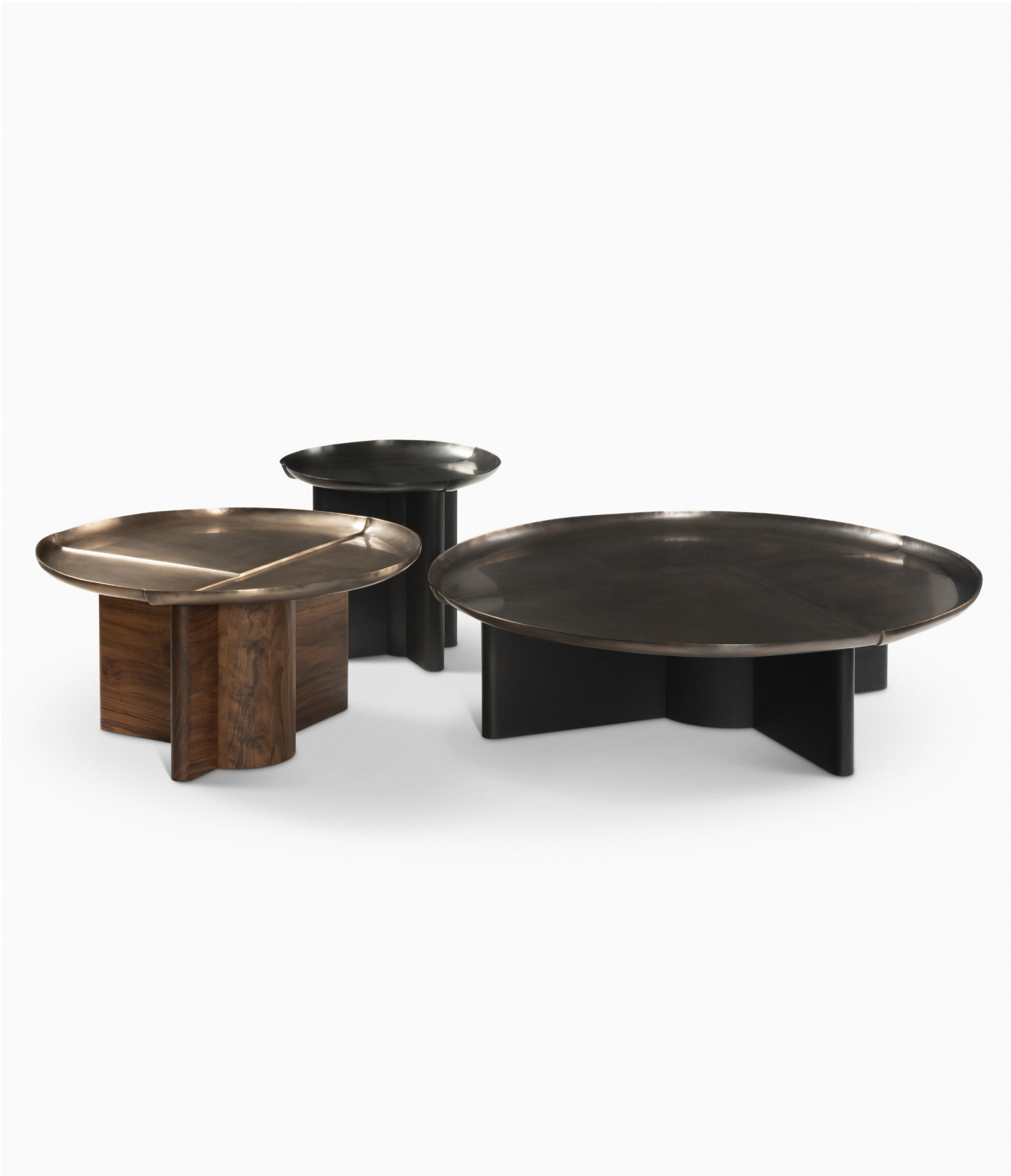
Noxon Cocktail Tables