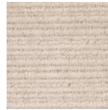
02 NATURAL STATE