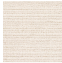
01 SOFT LIGHT

This item will have inherent dark threads running through due to the natural wool content.