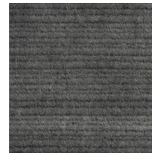
08 PERFECT GREY