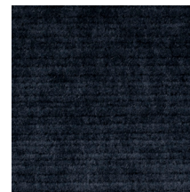
11 BLACK NAVY