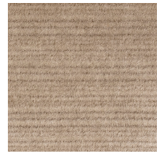
03 GOLDEN GREY