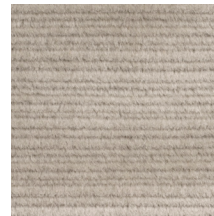
07 GREEN TEA