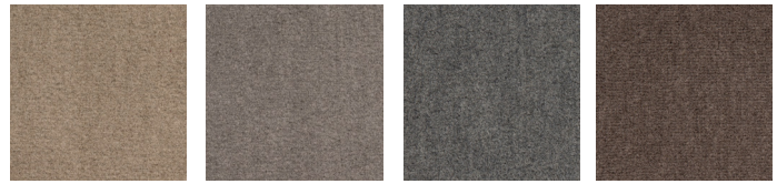
08 MOCHA 10 PERFECT GREY 04 SATELLITE 05 SEAL