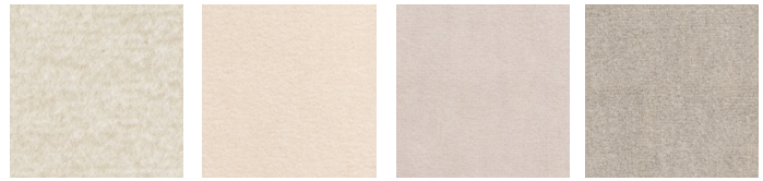
13 CREAM 06 SOFT LIGHT 01 LIGHT ASH 03 GREEN TEA