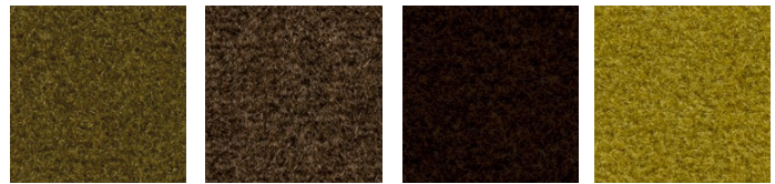
18 CLOVER 15 ANTELOPE 16 DUSK 17 CITRINE