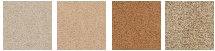
07 GOING GREY 02 CHAMPAGNE 09 TOFFEE 14 LIMESTONE