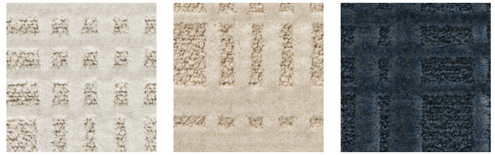
01 WHITE CAP