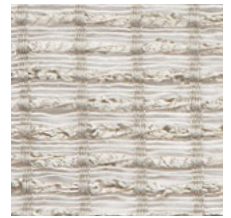
02 SILVER MARLIN