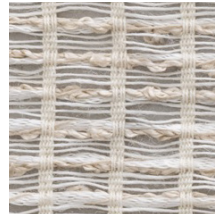
06 SOFT LIGHT