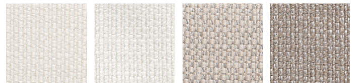
01 OPAL 02 OFF WHITE 04 SANDSTONE 05 DUNE

Our 3 year warranty covers No Worries fabric against loss of color or strength from normal use including exposure to sunlight, mildew and atmospheric chemicals. This warranty only covers the replacement of No Worries fabric and does not cover normal care and cleaning; damage from misuse or abuse; improper installation, or costs associated with replacement of the fabric, including labor and installation.