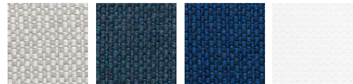
06 SILVER CLOUD 07 DARK AZUL 08 OASIS 11 BLEACHED