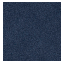
11 TRUE NAVY