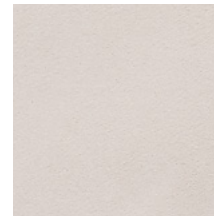
02 BRIGHT SILVER