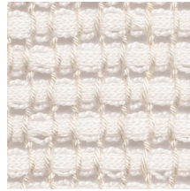
02 SPRING SNOW

Extensive cleaning instructions available at www.hollyhunt.com .