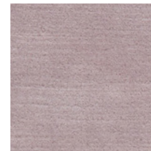
14 ROSE QUARTZ