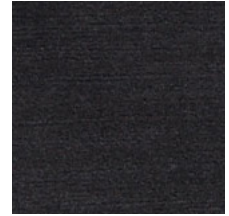
11 PITCH BLUE