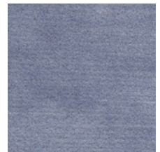
15 BLEU GREY