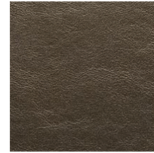
01 SILVER SHADOW