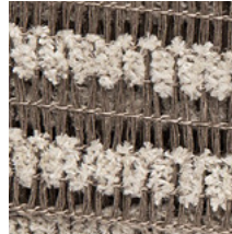
04 MOUNTAIN SIDE