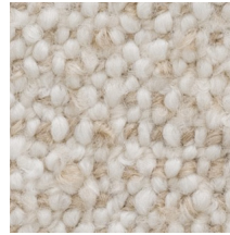
01 SOFT LIGHT