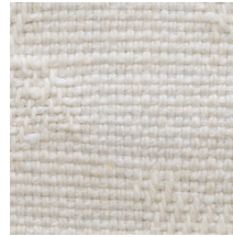
01 WINTER WHITE

Knit backing is recommended for use on Holly Hunt upholstered product. For all other upholstery, please consult your workroom.