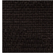
04 DARK KNIGHT