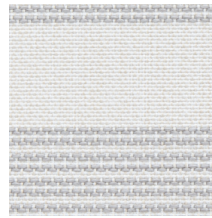
01 WARM & COOL