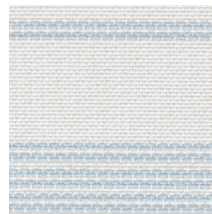
07 ICE WATER