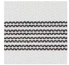
03 EBONY & IVORY