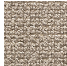
02 SAND DUNE