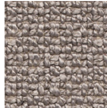
04 FRENCH LAVENDER