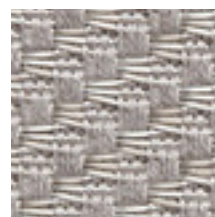
03 TINTED TAUPE