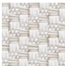
01 SILVER PEARL

Extensive cleaning instructions available at www.hollyhunt.com .