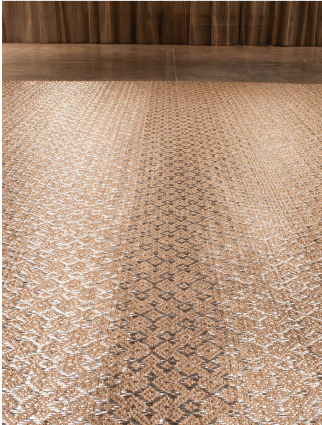
CASABLANCA WEAVE - Natural Figue Fiber warp & Stainless Steel weft