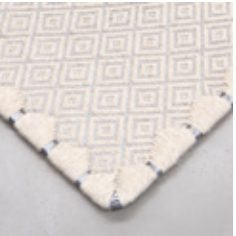
Medium Rhombus Weave