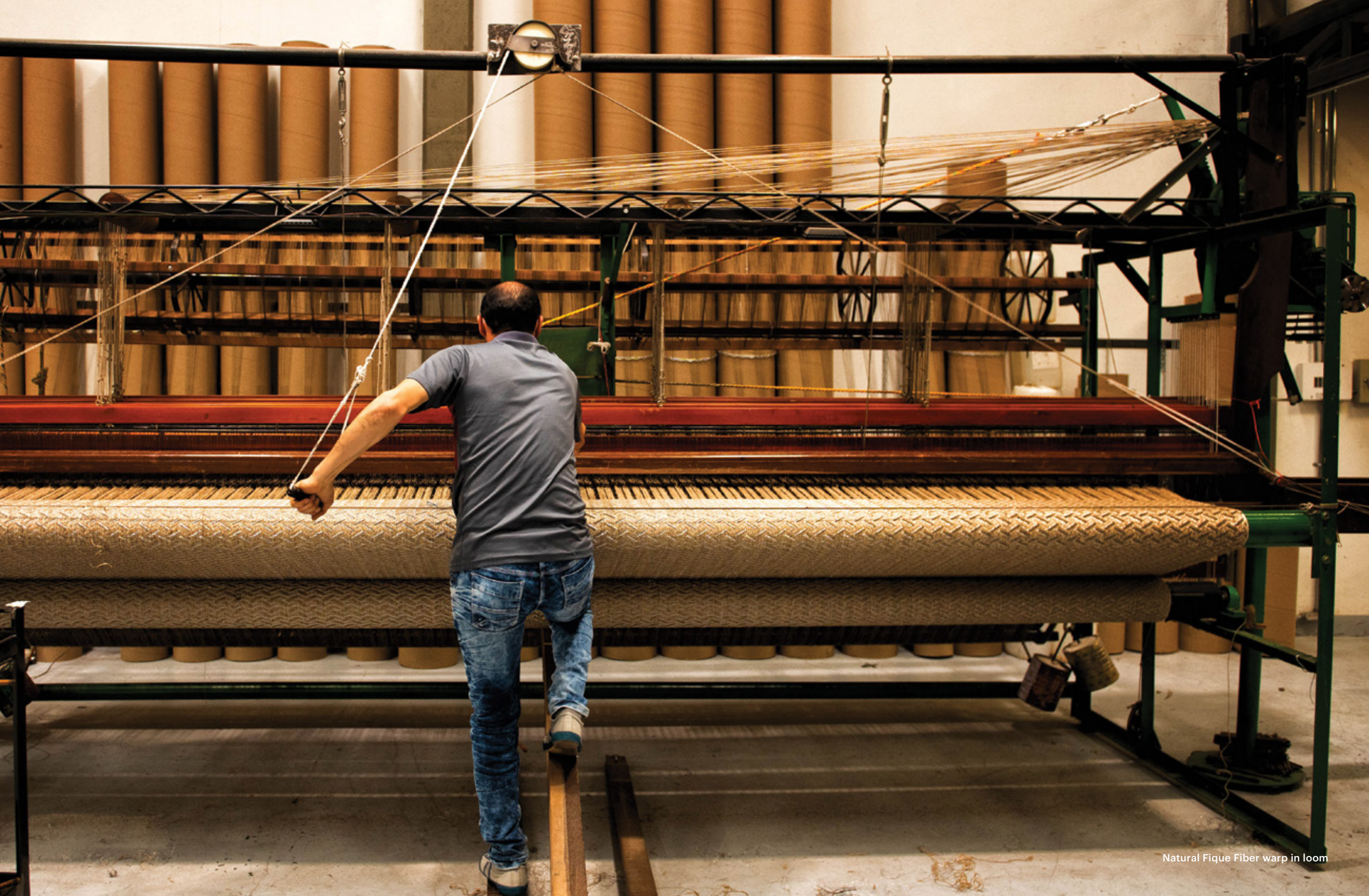
Natural Figue Fiber warp in loom