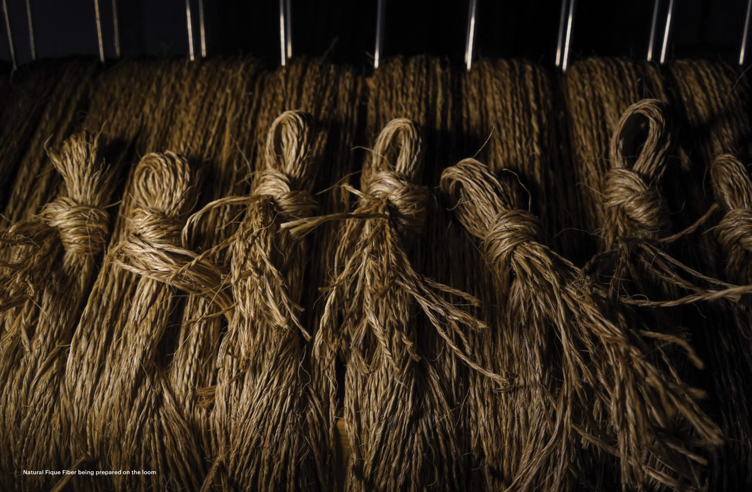
Natural Fique Fiber being prepared on the loom