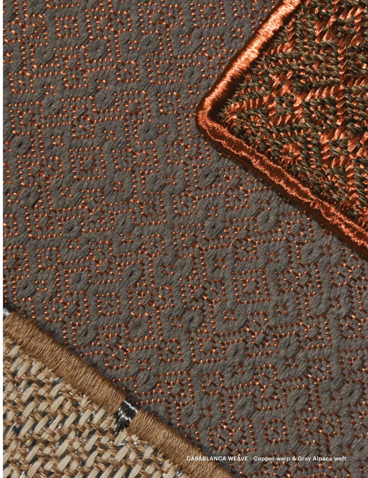
CASABLANCA WEAVE - Copper warp & Gray Alpaca weft