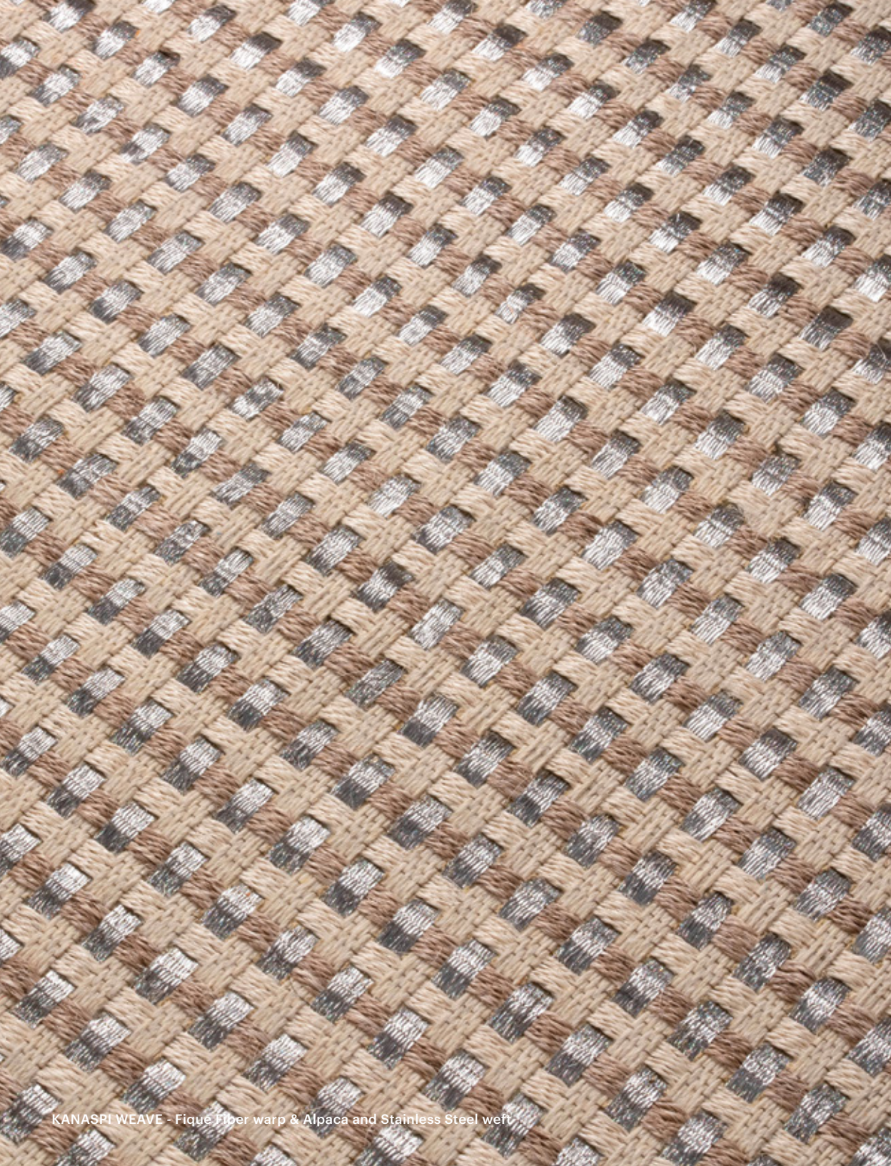
KANASPI WEAVE - Figue Fiber warp & Alpaca and Stainless Steel weft