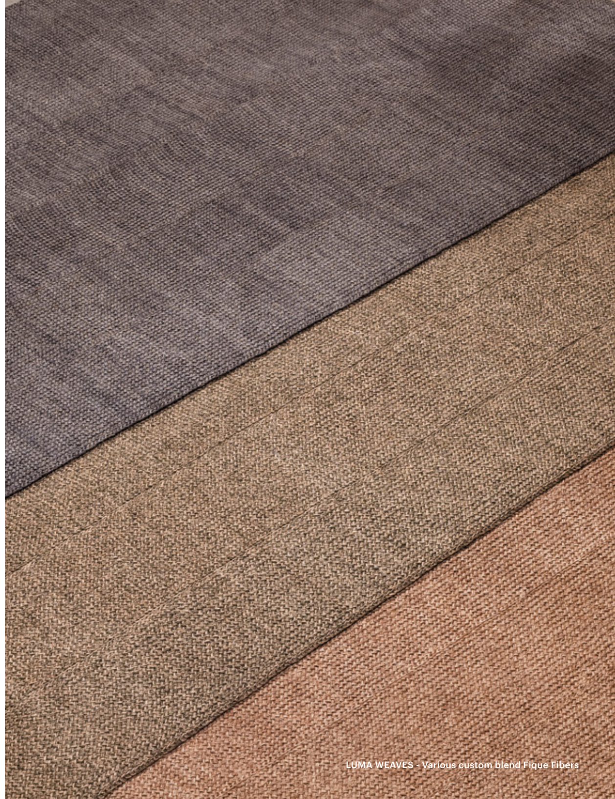
LUMA WEAVES - Various custom blend Figue Fibers