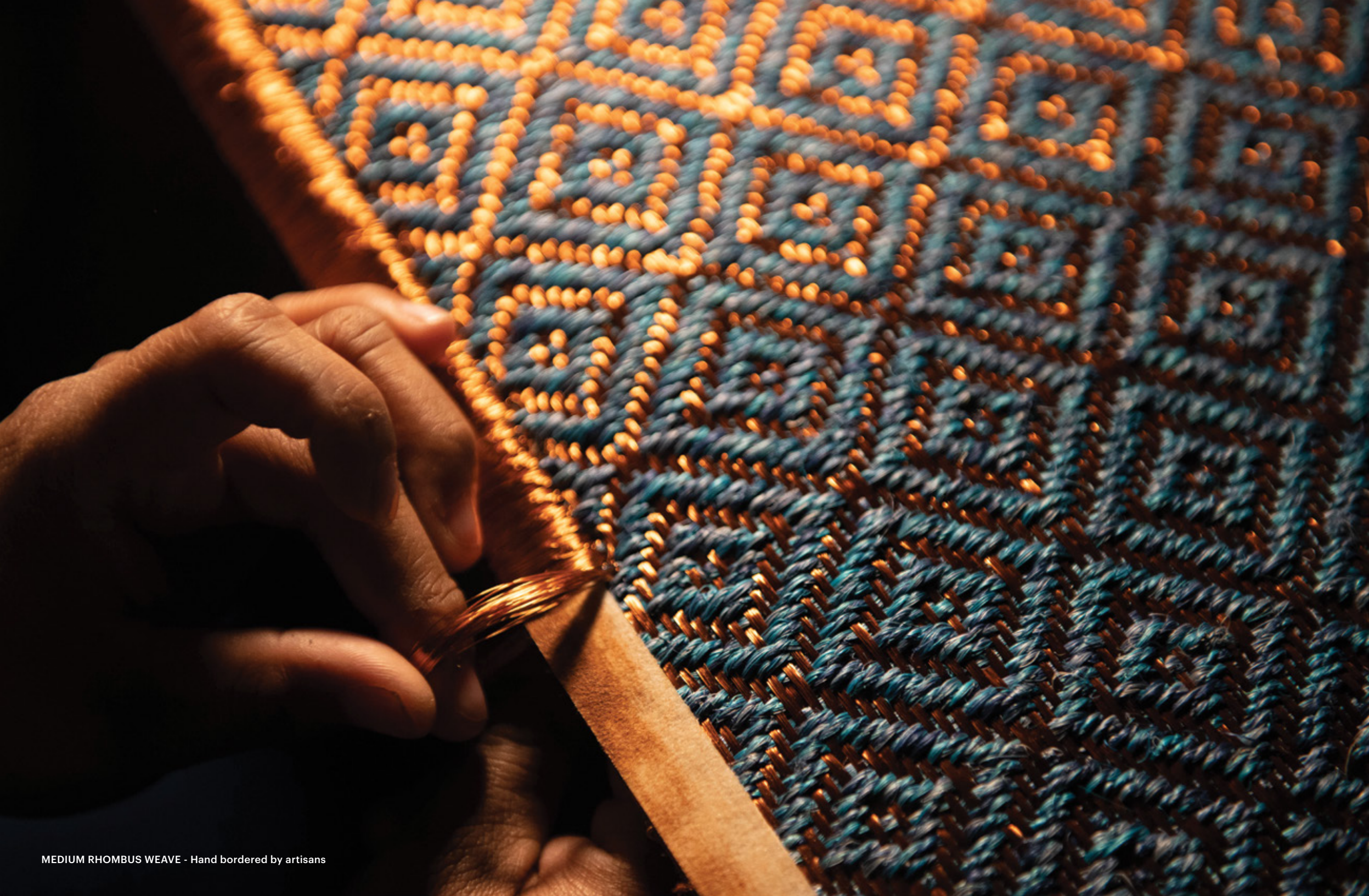
MEDIUM RHOMBUS WEAVE - Hand bordered by artisans