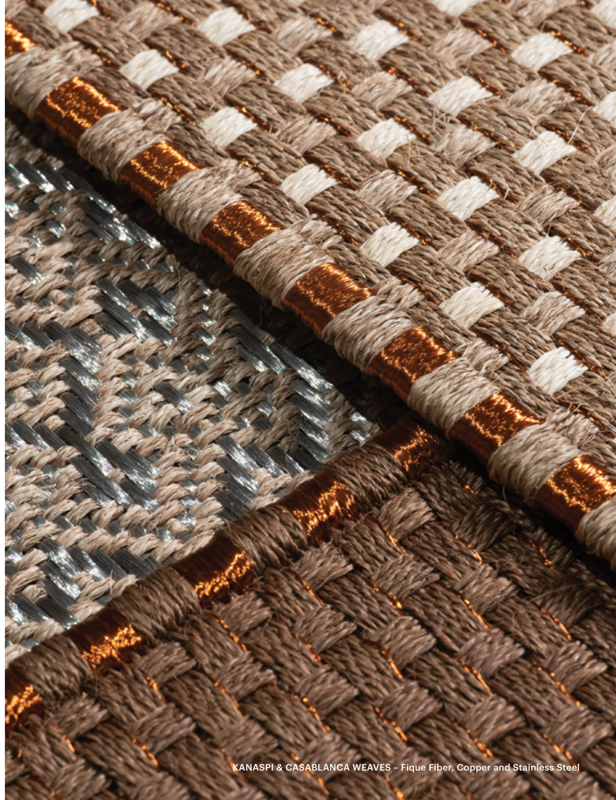
KANASPI & CASABLANCA WEAVES – Fique Fiber, Copper and Stainless Steel