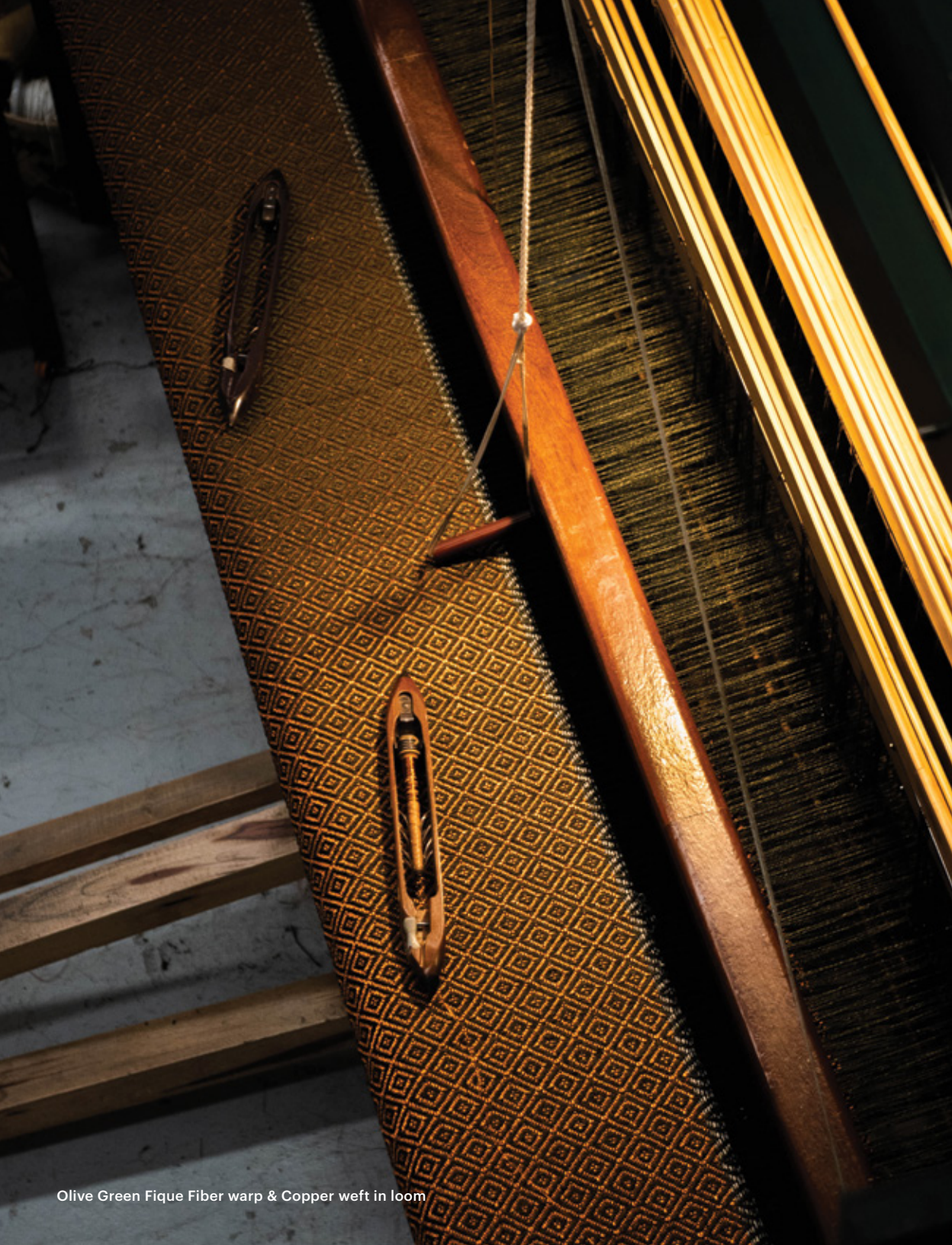
Olive Green Figue Fiber warp & Copper weft in loom