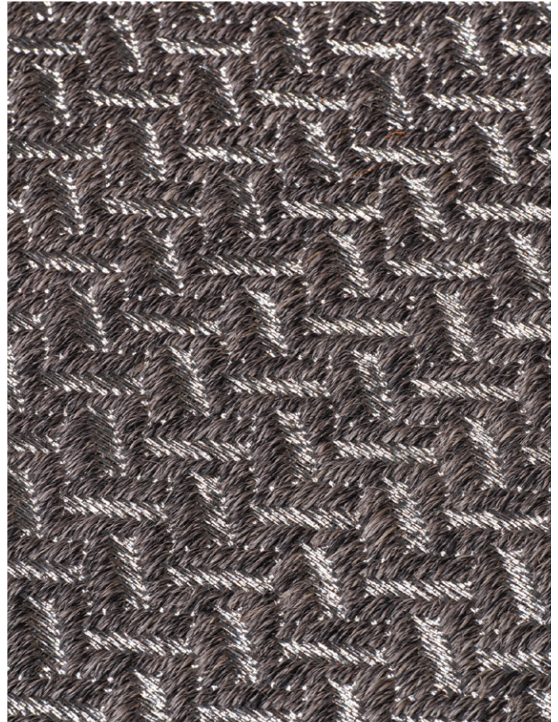
OTOÑO WEAVE - Black-Gray Figue Fiber warp & Stainless Steel weft