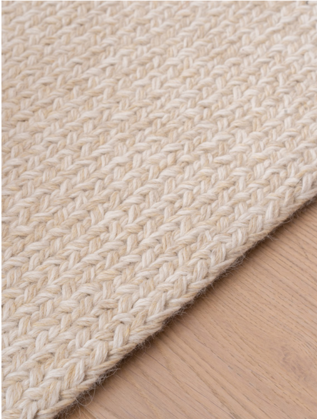
LUME WEAVE - 100% Natural and White Alpaca Wool