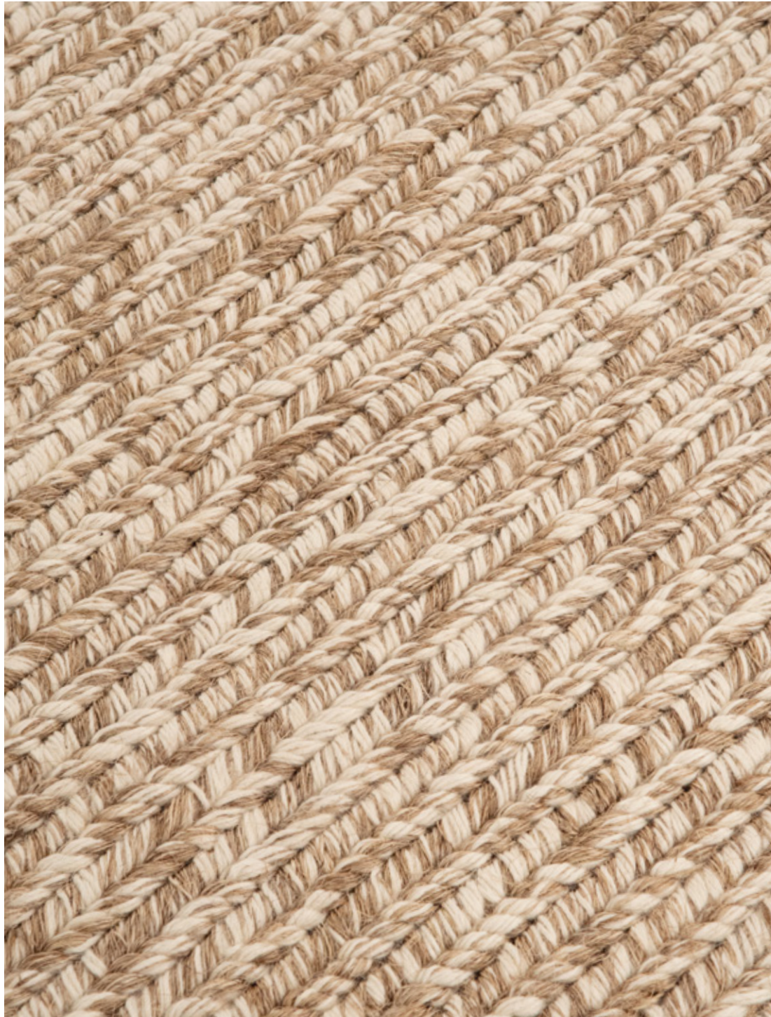
MESETA WEAVE - Natural Fique Fiber & White Alpaca