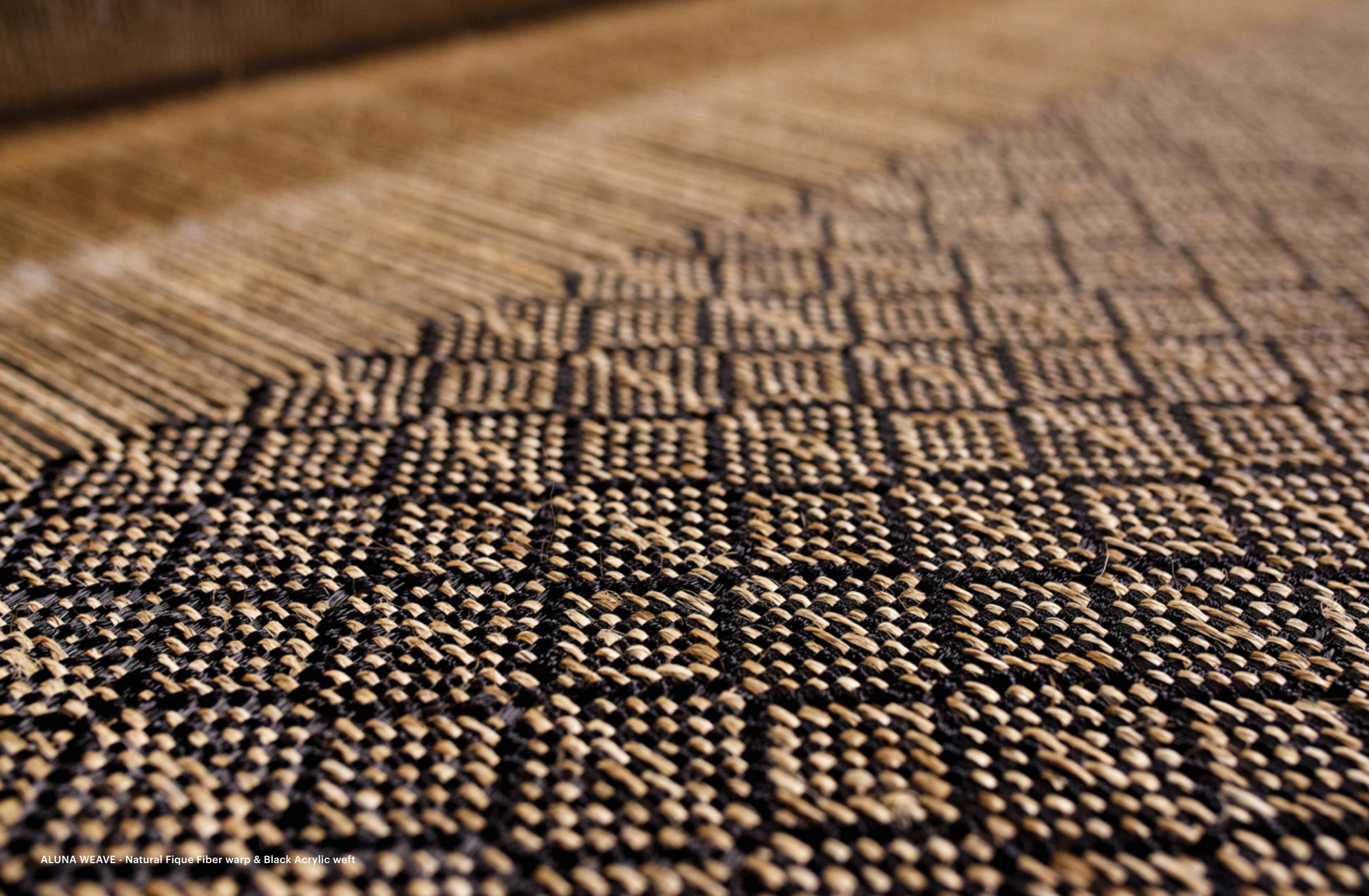
ALUNA WEAVE - Natural Figue Fiber warp & Black Acrylic weft