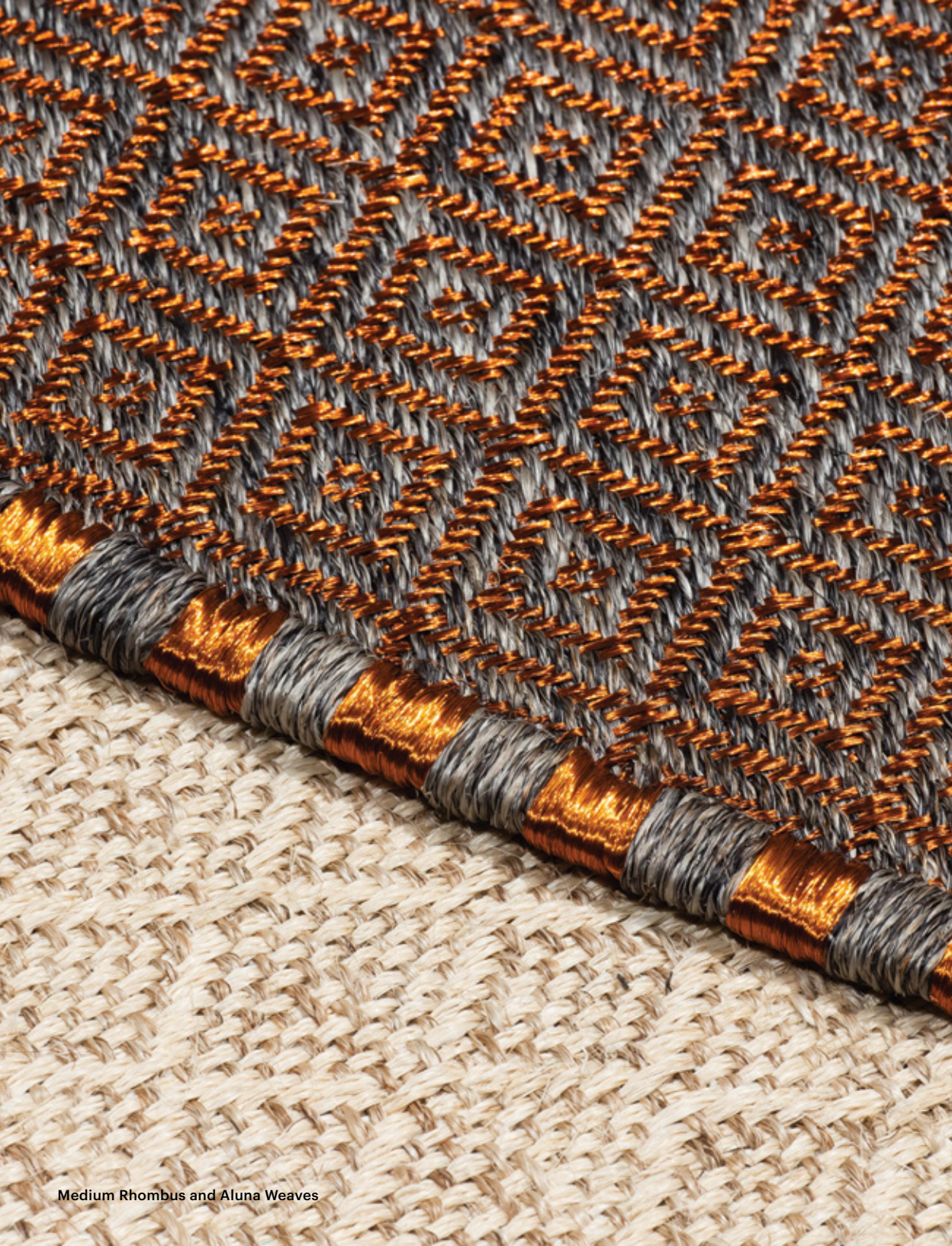
Medium Rhombus and Aluna Weaves