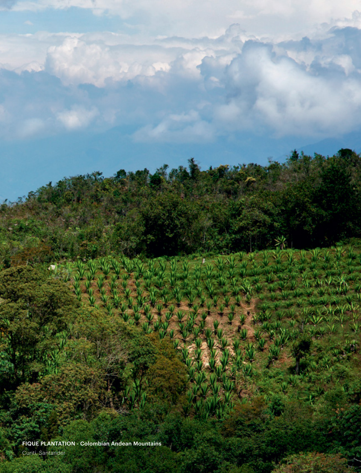
FIQUE PLANTATION - Colombian Andean Mountains Curiti, Santander

"My hope is that, someday, Colombian design will not only be recognized for its craft and uniqueness but also for its inclusivity and sustainability, for how every Colombian designer takes it one step further to really help out his or her community. This is one of the core values that VERDI wishes to represent and the ultimate goal it wishes to pursue."