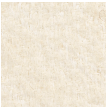
01 SOFT LIGHT