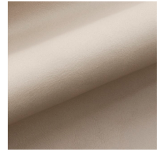
03 NATURAL STATE