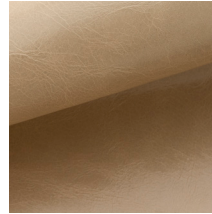
04 SANDY BEACH