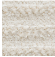
01 SOFT LIGHT