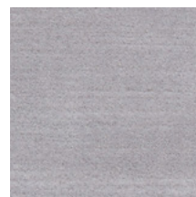
13 PALE GREY