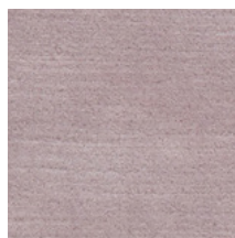
14 ROSE QUARTZ