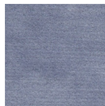
15 BLEU GREY