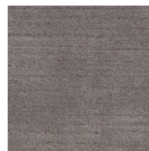
05 WINTER SKY