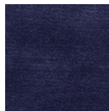
16 PRUSSIAN BLUE