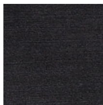
11 PITCH BLUE