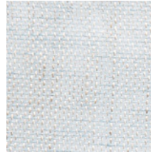
06 BLUE SPRUCE