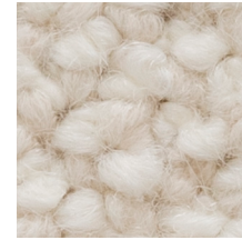
02 SOFT LIGHT