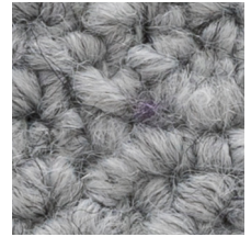
03 SILVER BLUE