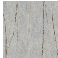
LX1723 Soft Silver