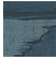
LX1529 Steel Blue