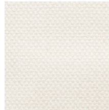
01 SOFT LIGHT