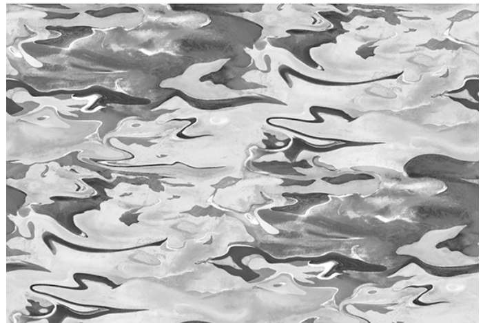
FULL REPEAT SHOWN