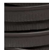
24 EARL GREY