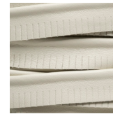
31 SOFT LIGHT