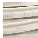
33 GOLDEN GREY