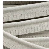
35 METAL PATINA