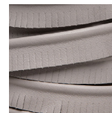
21 STEEL LILAC