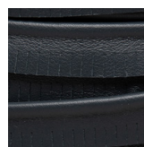
26 NEW BLUE