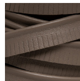
20 MOUNTAIN SIDE