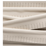
29 FIRST LIGHT