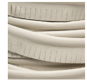
16 DEW DROPS