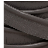
23 ABYSS HEATHER