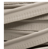
34 SILVER MOON