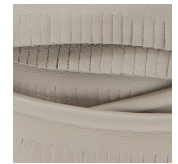
14 PERFECT STONE