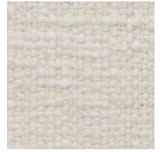
10 NATURAL STATE