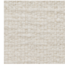
07 WINTER WHITE