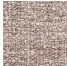
04 VALLEY FOG