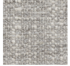
09 DEW POINT