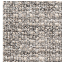
05 ELEPHANT EAR