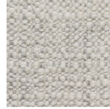
08 BRIGHT SILVER