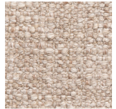
03 ROSE QUARTZ