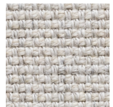
06 WARM & COOL