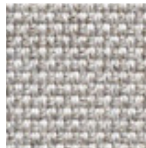
01 TRUE GREY