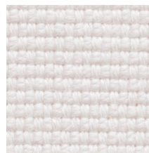
04 WHITE CLOUD

Extensive cleaning instructions available at www.hollyhunt.com .