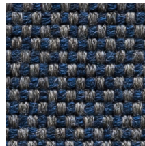
08 ICE WATER