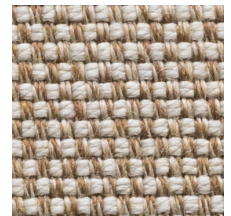
07 HARVEST GRAIN