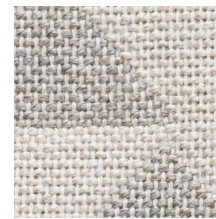
02 SILVER STONE