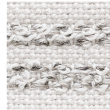
02 SILVER CLOUD