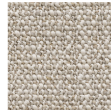
02 SAND DOLLAR