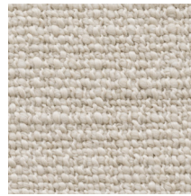
01 RIVER ROCK