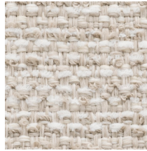
01 SAND DOLLAR